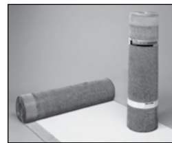
Colors: White, Black or Tan. (Black and Tan may require extended led times.)