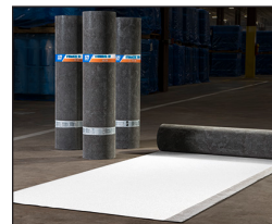
Color: Bright White only

System Compatibility This product may be used as a component in the following systems. Please reference product application for specific installation methods and information.