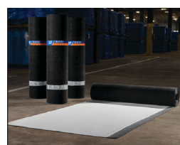
Colors: White or Black.

System Compatibility This product may be used as a component in the following systems. Please reference product application for specific installation methods and information.